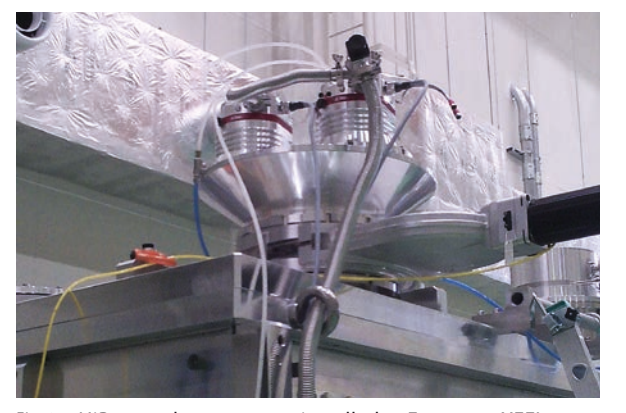
Fig. 2 HiPace turbopumps are installed at European XFEL.

needs and demands of these applications.