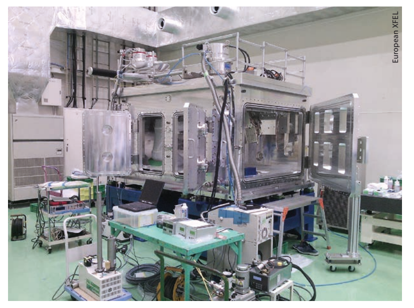
Fig. 3 The interaction chamber at European XFEL is equipped with Pfeiffer Vacuum solutions.

Special vacuum components such as flanges and pipe components were developed for the use in European XFEL's electron beam lines. Moreover, the turbopumps and mass spectrometers were designed in close cooperation with the customer to match the requirements. Also special editions of leak detectors were delivered according to the customer's demands. Therewith, Pfeiffer Vacuum successfully provided tailored vacuum solutions from a single source for the UHV and HV at the European XFEL.