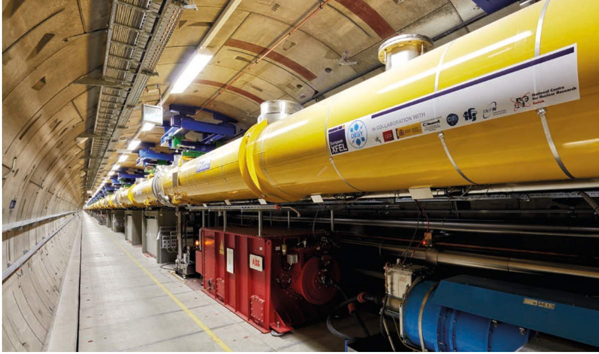
View inside the XFEL accelerator tunnel

Pfeiffer Vacuum supplies the European XFEL with vacuum solutions. Fabian Frey